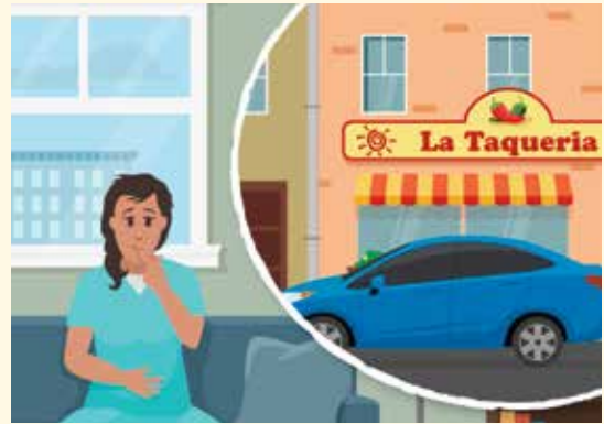
Stats, STAT!: Is Noninferior Not Inferior?